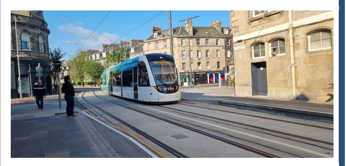
Pilrig Street to Annandale Street / Montgomery Street / Elm Row

A programme of work to install further signage and the creation of a yellow box junction at the Leith Walk / Great Junction Street / Duke Street junction is being developed. The Scottish Water works at Dalmeny Street are now completed and the junction reopened.