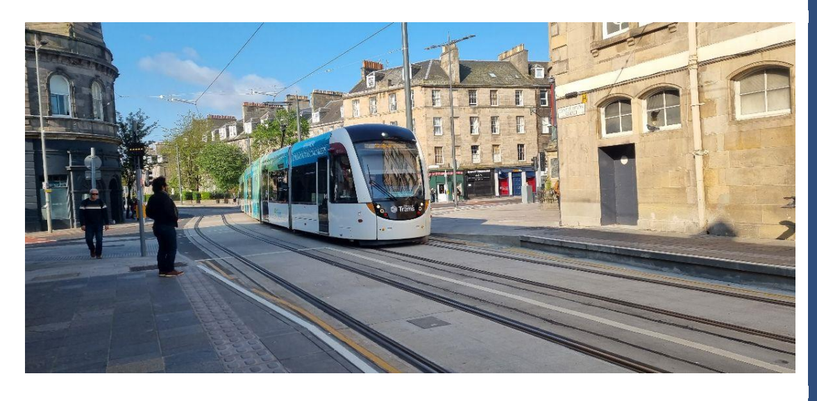
Pilrig Street to Annandale Street / Montgomery Street / Elm Row

Scottish Water are undertaking works at Dalmeny Street (repairs to deal with flooding issues).