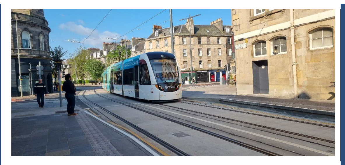
Pilrig Street to Annandale Street / Montgomery Street / Elm Row

Scottish Water are continuing works at Albert Street. <u>Full details of the works that are</u> being undertaken can be found on the Scottish Water website.