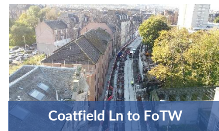
Coatfield Ln to FoTW