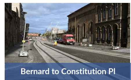
Bernard to Constitution Pl