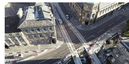
Bernard/ Baltic St Junction