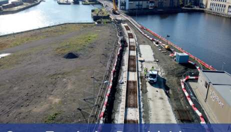
Ocean Terminal to Rennie's Isle