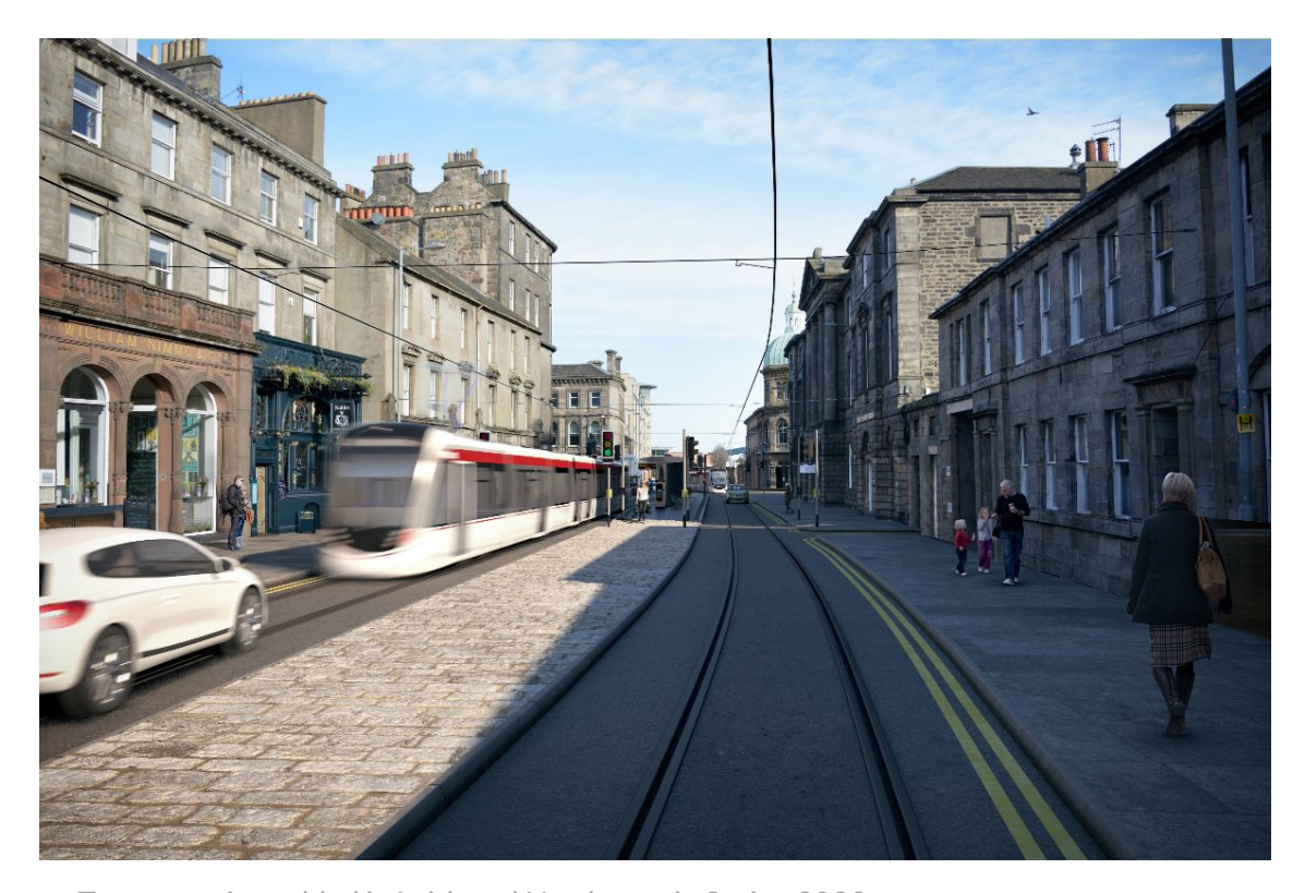
Trams are timetabled in Leith and Newhaven in Spring 2023.