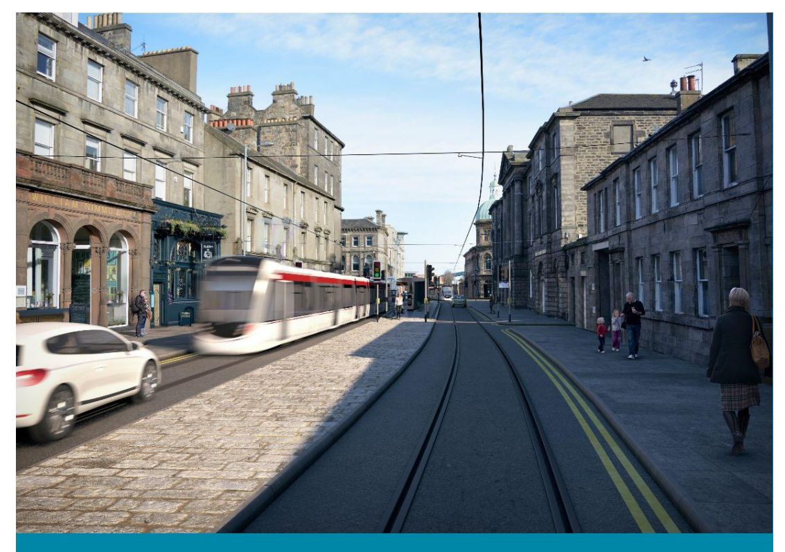
Edinburgh Trams are scheduled to run between Newhaven and the airport from early 2023

The first phase of work to take trams to Newhaven is scheduled to get under way on Constitution Street in mid-November, following six months of joint work by the Council and contractors to finalise the construction programme and costs for the project.