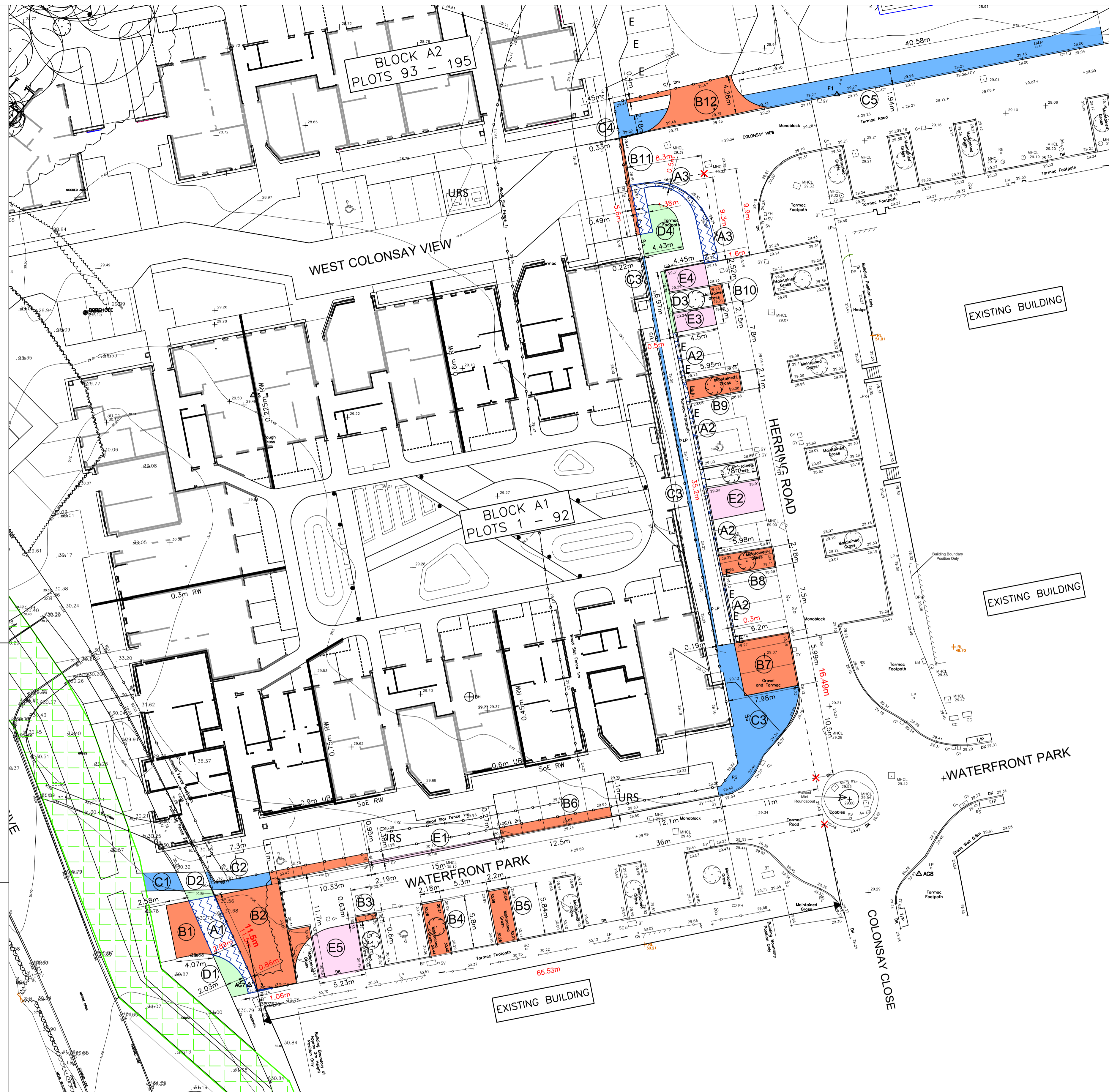
REDETERMINATION LAYOUT SCALE 1:250