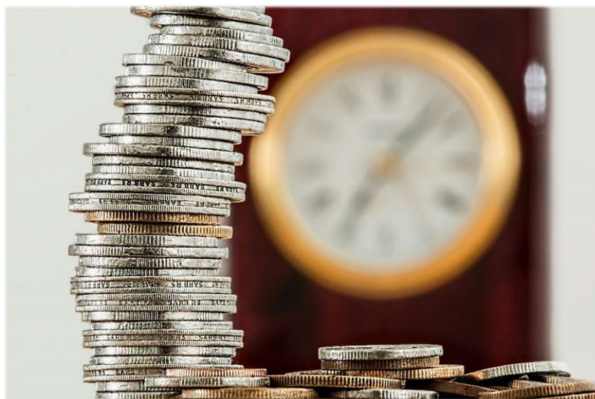
Money and a clock. The Community Grants Fund is a Council budget that must be spent each year.

Organisations working with people across the whole city, or in large areas, cannot apply. The work must happen in smaller areas. Every year the money gets spent and the Council tops the budget up again the next year, in April.