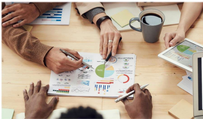
People working together to plan a project. They are using information to help them understand what is needed.