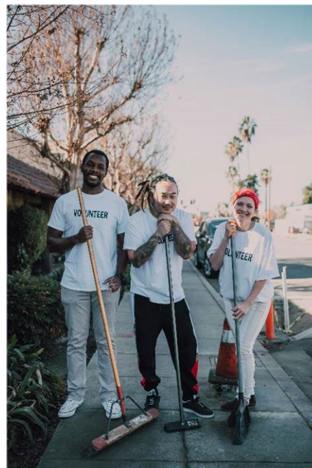
Street cleaning volunteers.