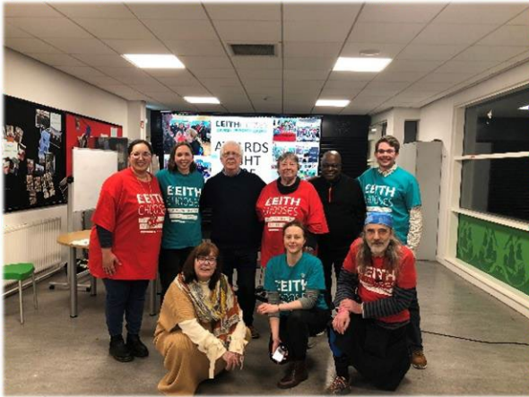
A picture of the Leith Chooses steering group at the award ceremony.

Sometimes the money gets spent in 1 meeting. It depends on how many organisations apply and how good their ideas are.