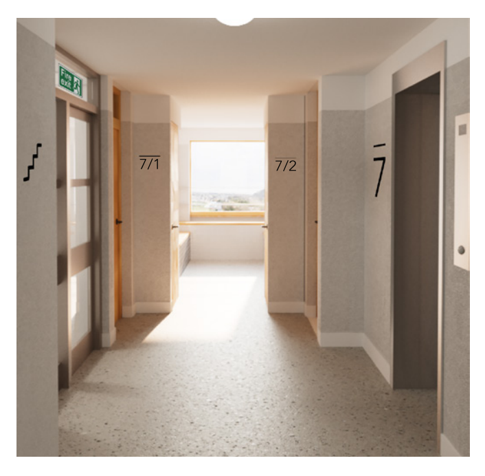
Upper Floor Lobbies