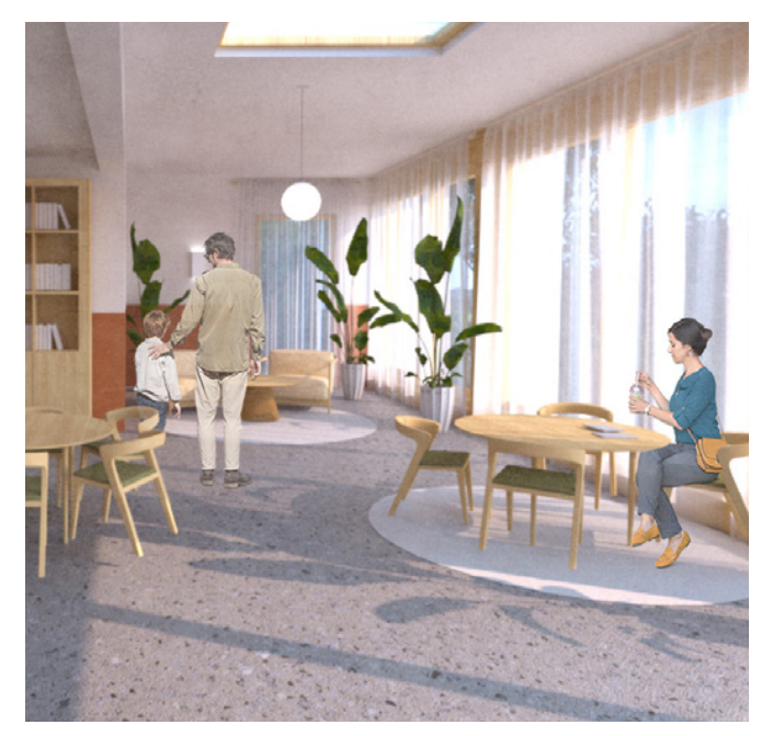
Shared resident space