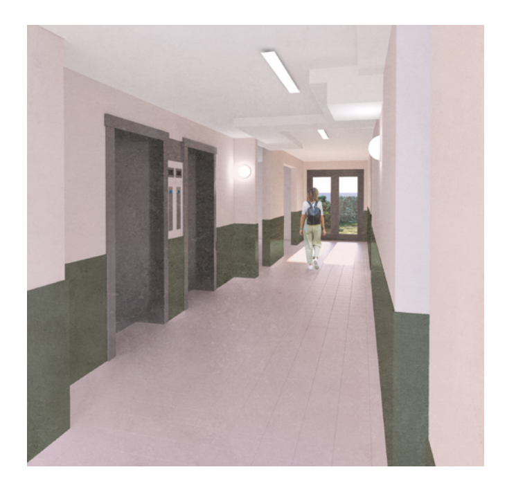
Main Entrance Lobbies