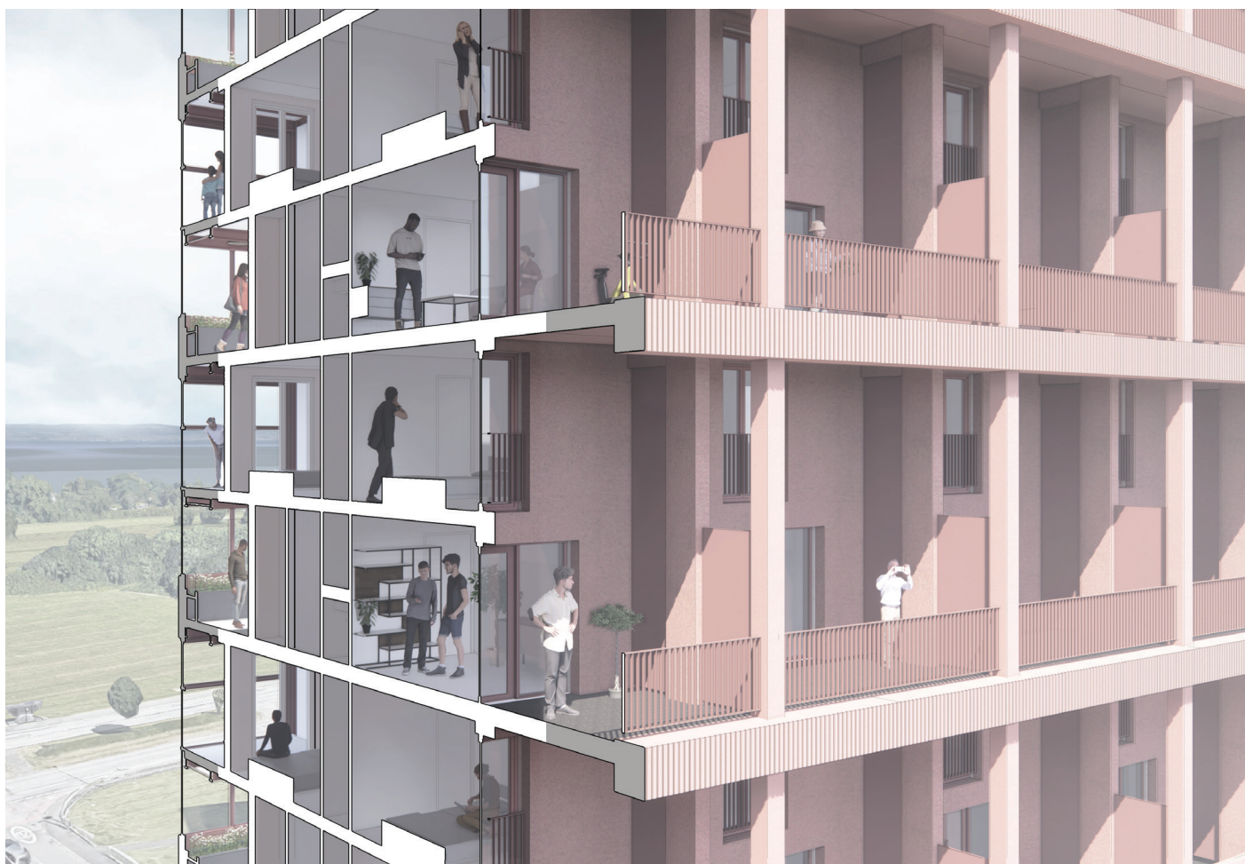
Section through the extended Balconies

This will allow the Council to appoint Contractors to construct the proposals, and deliver the best outcomes for all residents.