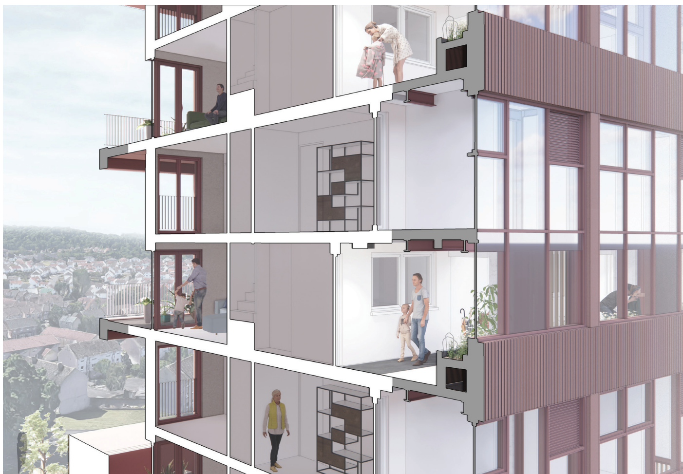
Section through the extended Access Decks

You may have seen this testing taking place in communal circulation spaces, and in some of the void properties. The Council and their project team ensure the highest levels of safety are maintained so there is no risk to health.