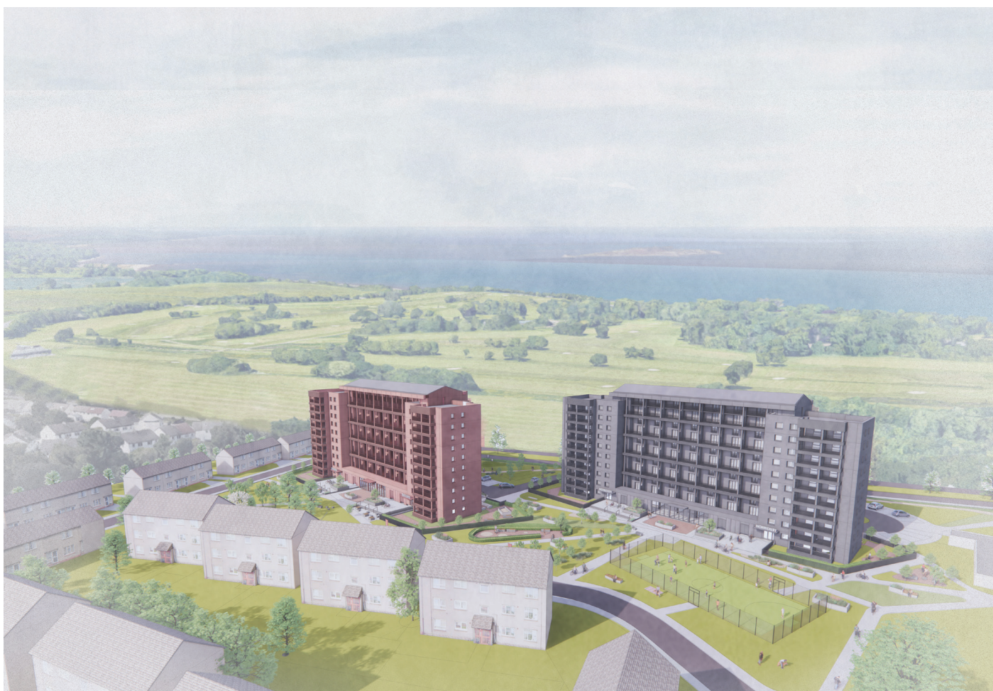
Aerial view of the proposed landscape works

The project is very complex, and requires lot of work to be done in the landscape around both Oxcars