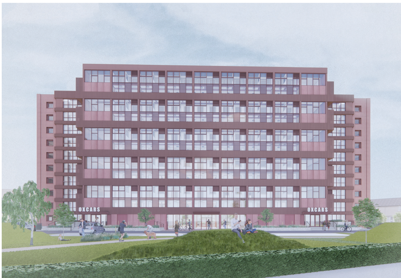
Proposed changes to Oxcars Court

The main contractor will be in touch at a later date to organise this.