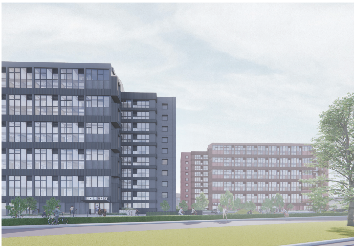
View of the proposed works to Inchmickery & Oxcars

Every resident should expect either a phone call or a visit in person from the Council's Housing Officer(s) in the next few weeks. There will also be another Tenant Engagement Session organised in the coming months. We will send out further information on this closer to the time.