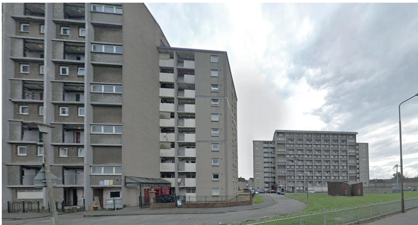
Oxcars & Inchmickery from the North - Existing

In March 2023, a Planning Application was submitted for the proposed works to both Oxcars & Inchmickery.