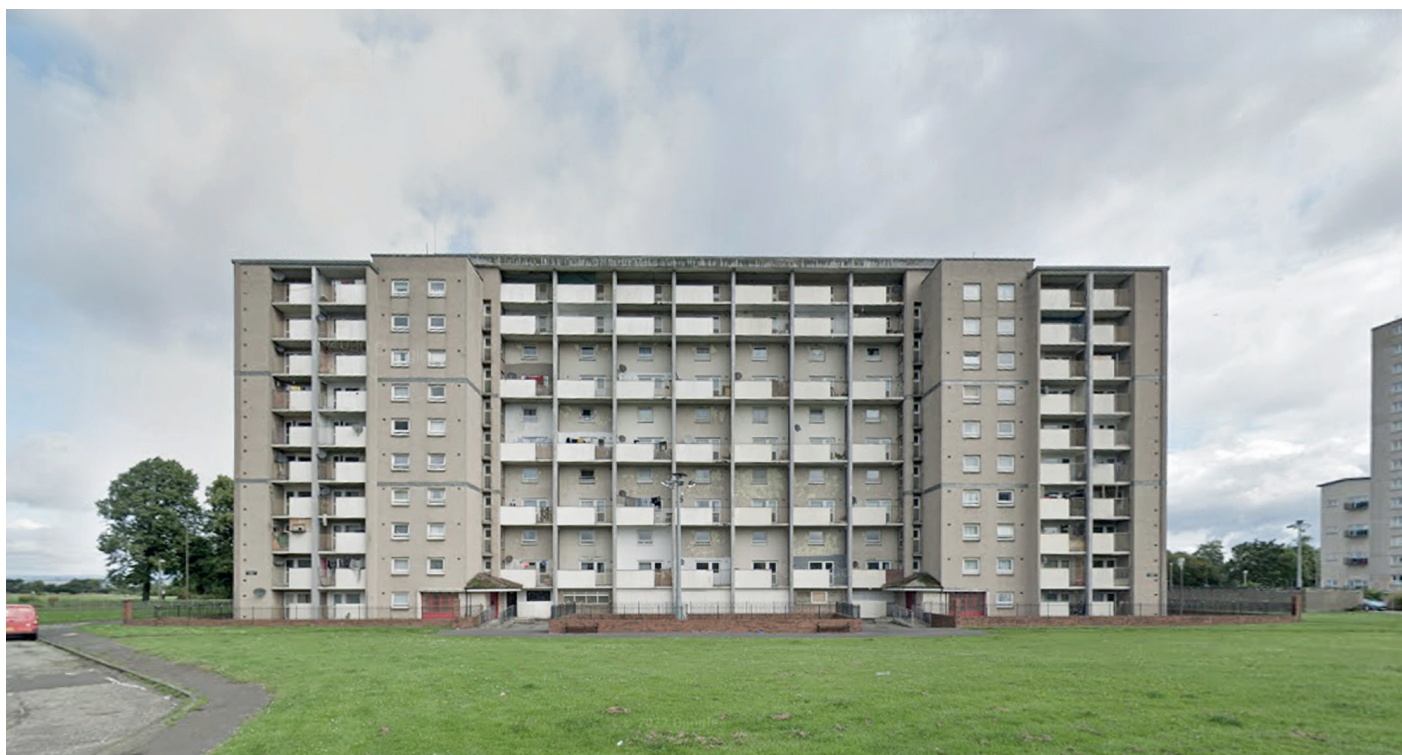
Inchmickery Court from the South - Existing

The Council will hold a second set of Foyer Sessions. The sessions will