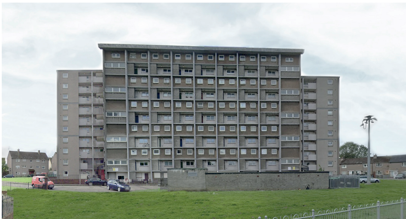
Oxcars Court - Existing