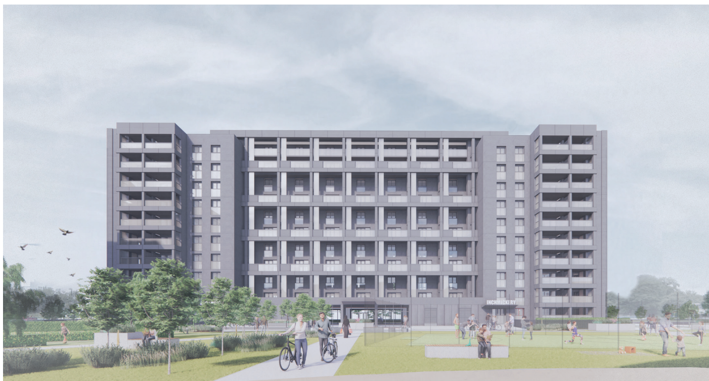
Inchmickery Court from the South - Proposed