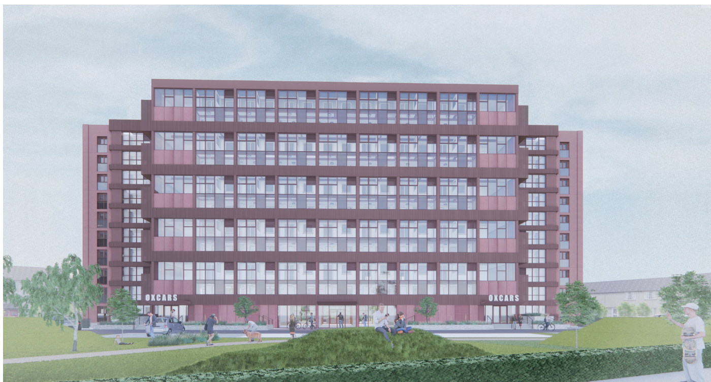
Oxcars Court - Proposed

- Scottish Fire and Rescue Service (SFRS), the Council's Planning, and Roads Departments have all been consulted to ensure changes to the buildings and landscape will make them safer, better places to live.