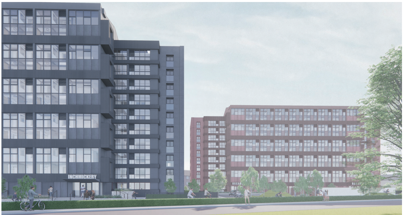
Oxcars & Inchmickery from the North - Proposed

Resident input is very important to the Council and their Design Team. Feedback from residents has helped change the designs to deliver outcomes that residents want.