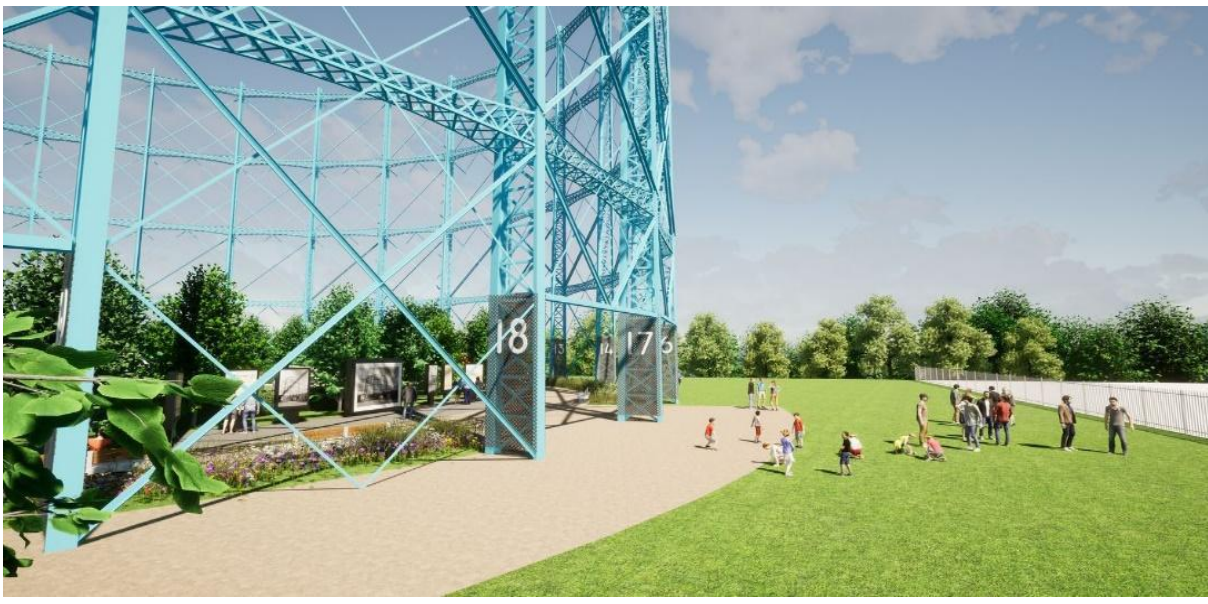
Visualisation of completed Gasholder – Section