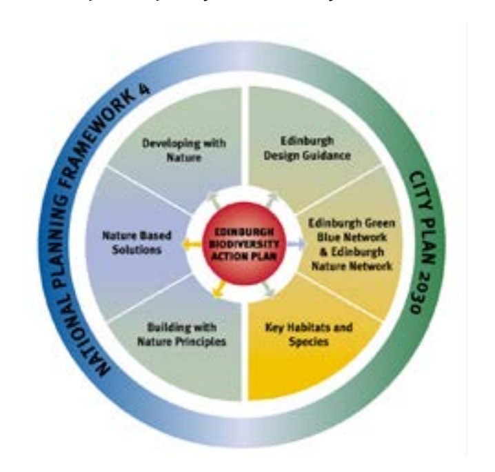
Figure 8.1 Links from EBAP to Planning and Development policy and delivery.