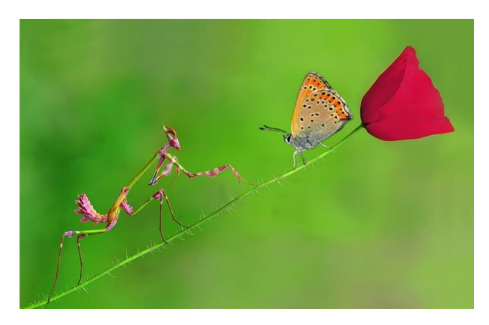
Write your story here.