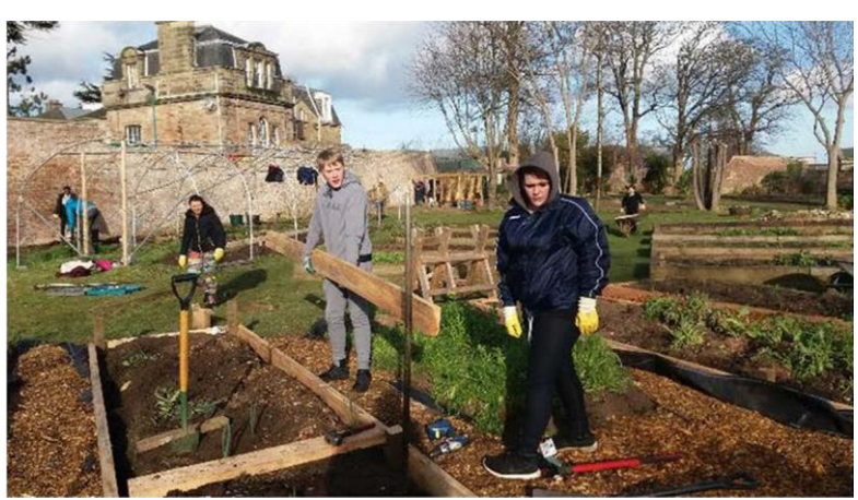
Gracemount Walled Garden, (Image Source: https://www.transitionedinburghsouth.org.uk/highlights-from-a-year-at-gracemount-community-garden/)

Transition Edinburgh South (TES) supports Gracemount Community Garden which grows fruit and vegetables in the walled garden in the grounds of Gracemount Mansion house. Their part-time gardener works with local volunteers using organic regenerative horticulture. All who are involved are welcome to harvest the produce and much of it goes home with local school children.