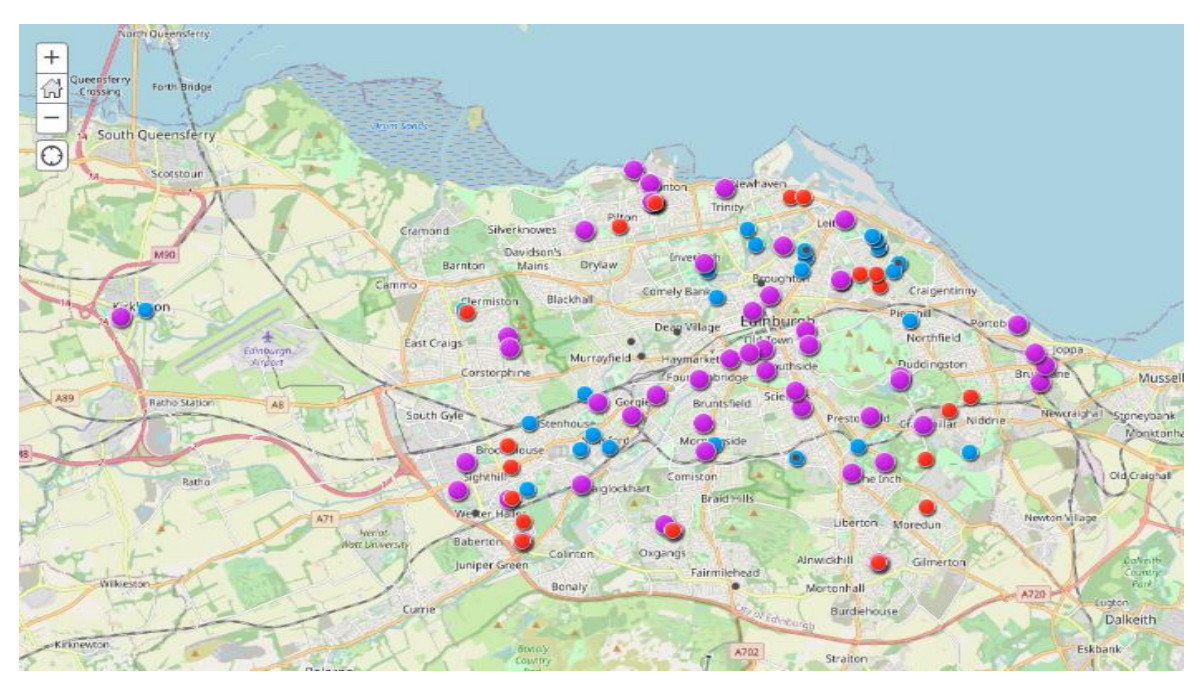
Figure 4: Growing sites and food projects in Edinburgh

As part of the development of this strategy, we invited citizens and organisations to tell us about any food