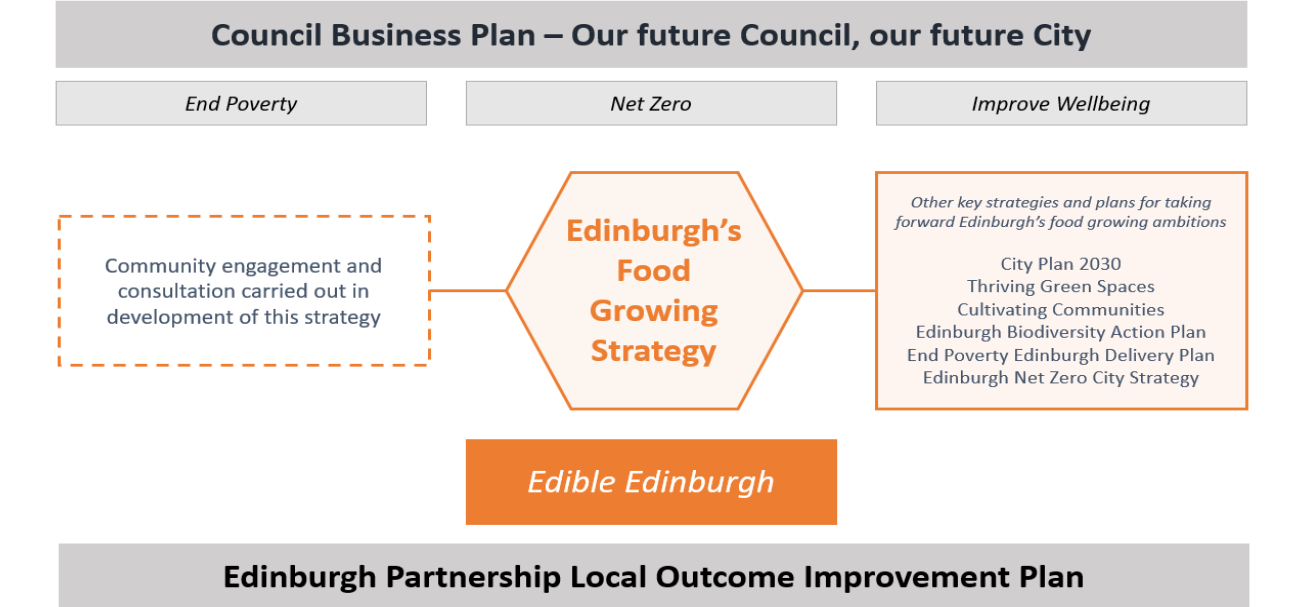
Figure 3: How Edinburgh's Food Growing Strategy links to the Business Plan outcomes

Lastly, raising awareness and engagement in food growing and sustainable food were seen as important, to encourage more involvement in food growing, increase the physical and mental health benefits of good food and allow networking of growers, local food retailers and consumers to help develop Edinburgh's sustainable food system.