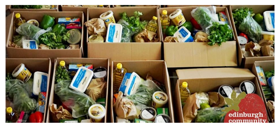
Food boxes delivered by Edinburgh Community Food during Covid-19

Edinburgh Community Food (ECF) has supported citizens to access fresh food and nutritional education for 25 years. ECF has been a key partner in the Council's Discover! programme since it started, working closely with Lifelong Learning teams across the city to develop a blended range of themed activities, supporting over 330 children and families. For Discover! 2020, a Scottish-themed food and activity box was developed and delivered to families.