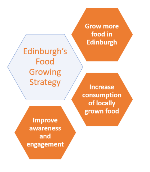
Figure 1: The three objectives of Edinburgh's Food Growing Strategy

'Growing Locally' is a city-wide strategy developed in collaboration with the Edible Edinburgh partnership, Transition Edinburgh and Edinburgh Community Food.