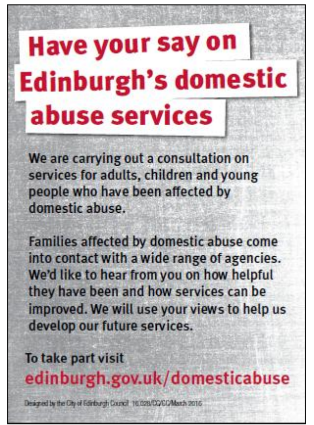
Figure one: 'Have your say on Edinburgh's domestic abuse services' postcards

In April 2016, 8000 postcards and posters were distributed across Edinburgh to voluntary sector organisations, community councils, pharmacies, GPs, hospitals, dentists, leisure venues, children and families facilities, community centres, schools and Council venues (see Figure one).