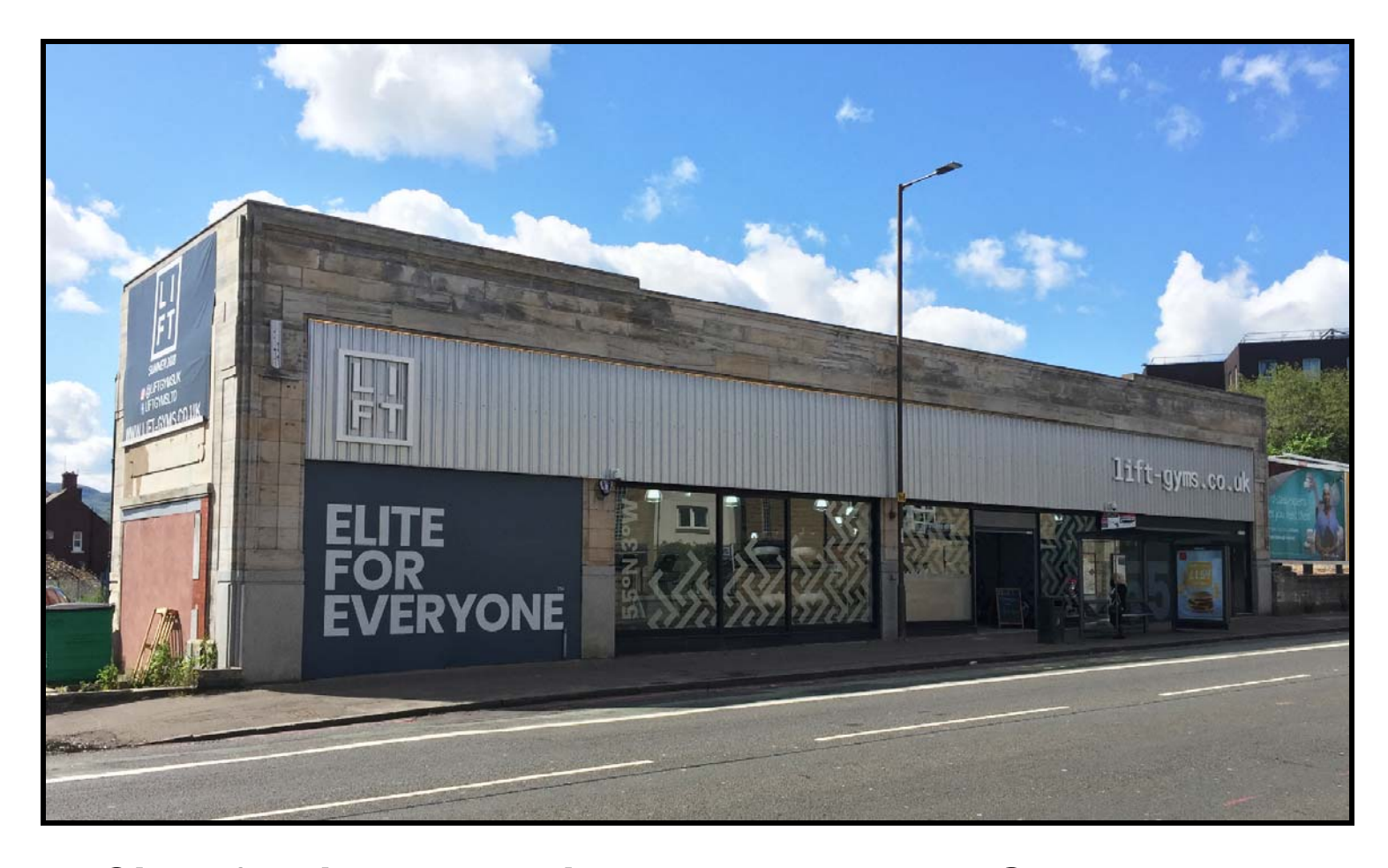
City of Edinburgh Leisure Development Schedule 2018