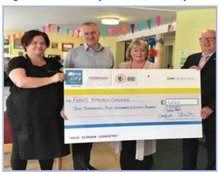
Figure 2 – Community Benefits, One City Trust – Grant award

through, which organisations are encouraged to apply for funding. The Main Grant Programme which awards projects up to the value of £10,000 and the Lord Provost Rapid Action Fund, for smaller projects up to the value of £2,000.