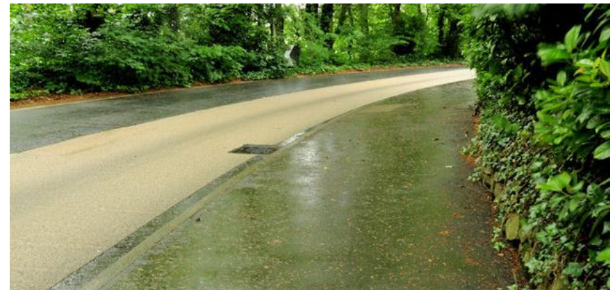
HFS on large bend in the road with wet weather conditions, Albert Bridge (2012)