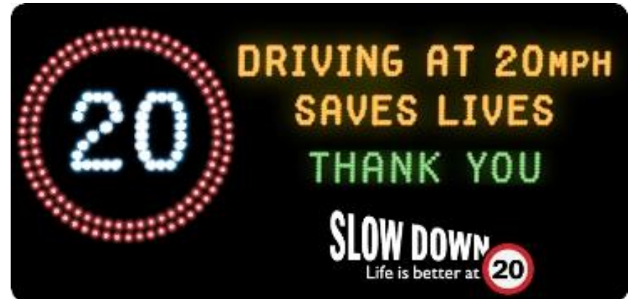
The City of Edinburgh Council