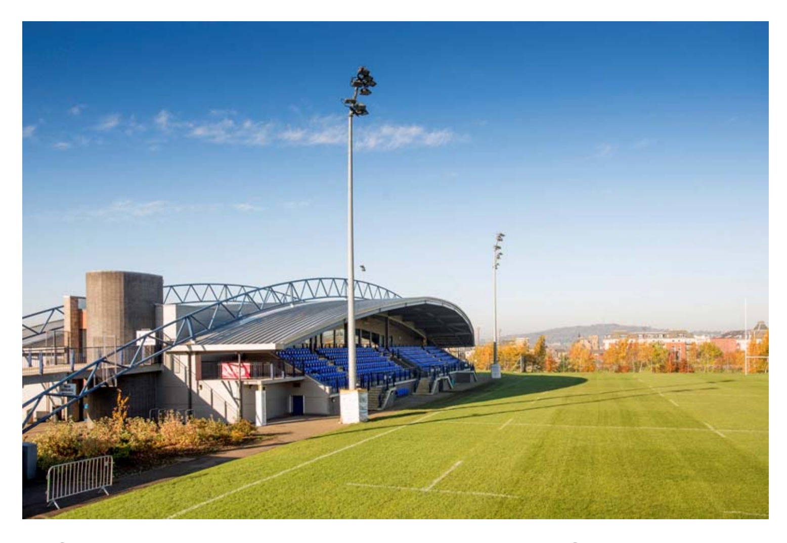
City of Edinburgh Leisure Development Schedule 2017