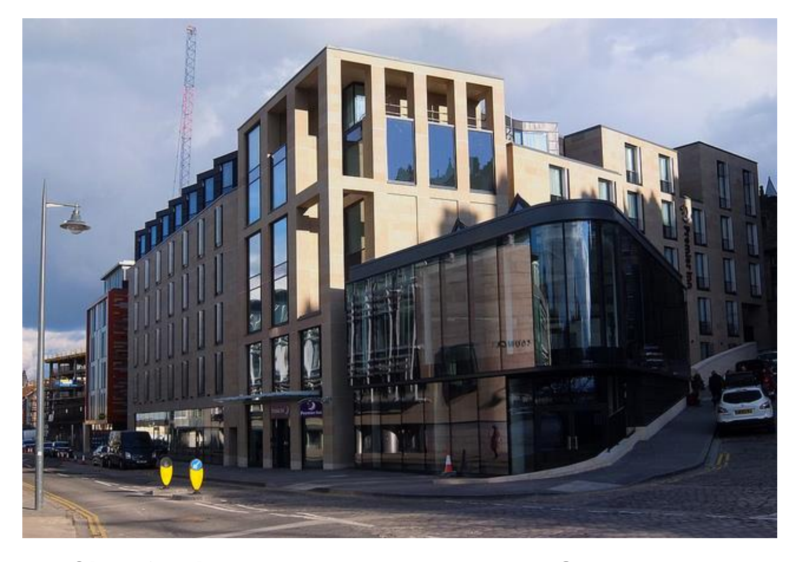
City of Edinburgh Hotel Development Schedule 2017