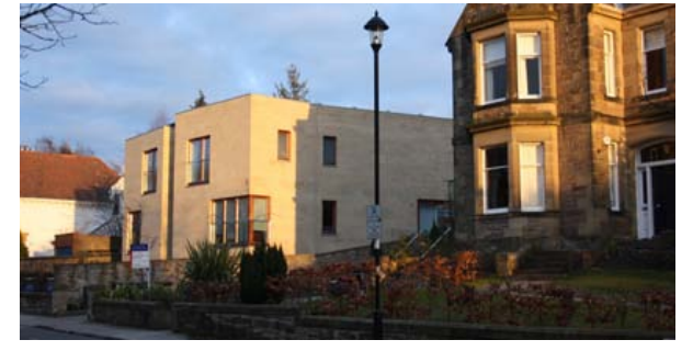
A local development—house at Wester Coates