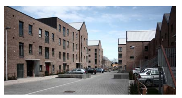
Major development—Housing at Gracemount