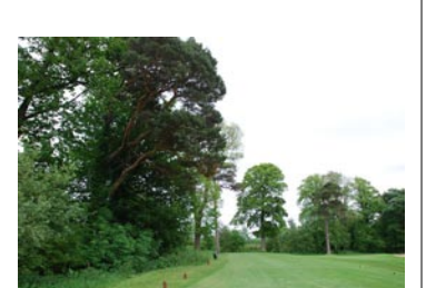
Perimeter tree belt, north boundary