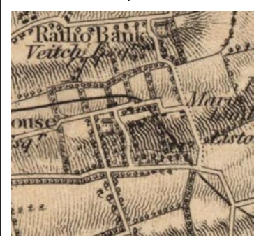
Thomson's map 1832