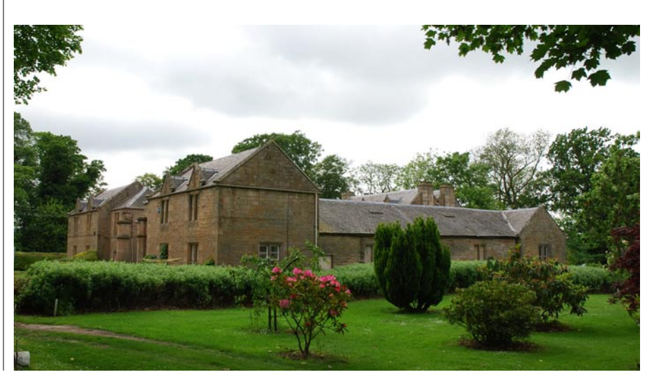
Stables cocurtyard from south-east