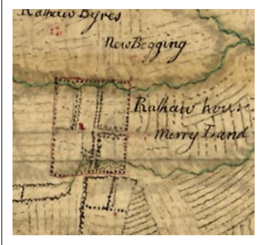
Roy's map c.1750