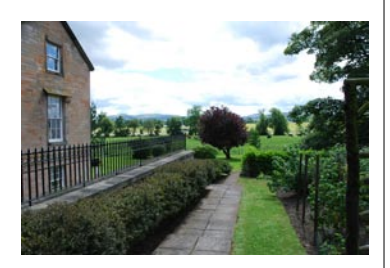
View over garden to Pentland

Parkland and north boundary trees with RBS Gogarburn beyond