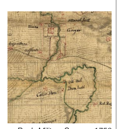
Roy's Military Survey c1750

Appears on Roy's map (c1750) as Caller Stone as a group of buildings like a fermtoun. Sharp, Greenwood & Fowler (1828) show a house called Callerstone in the eastern of two tree-belted enclosures with a walled garden to its southwest. The same basic arrangement is seen on the six-inch 1st edition OS map where a small house, now named Kellerstain, stands in parkland with a square quartered walled garden and a courtyard of farm buildings with a Threshing