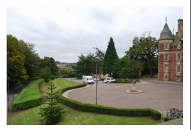
Turning circle at main entrance

Main approach on the line of the old drive and lime avenue