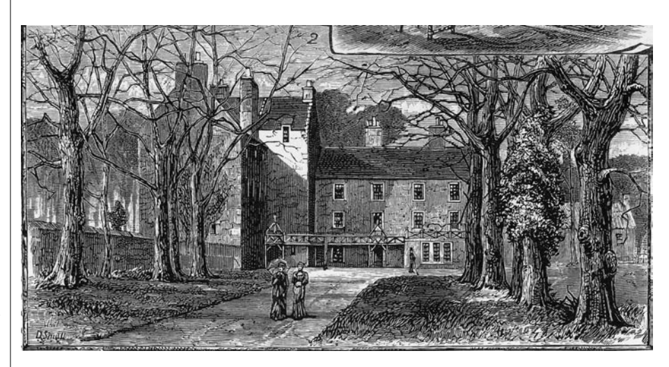
Etching of Old Craig from Cassell's Old and New Edinburgh

The development of Craighouse is a good example of a change of use of historic buildings. An Historic Buildings Grant was secured on the basis of the importance of Craighouse to Scotland's heritage. Alterations to the interior layout and details of the buildings were kept to the practical minimum and the overall cost of work at Craighouse by the end of 1996 was £14m.