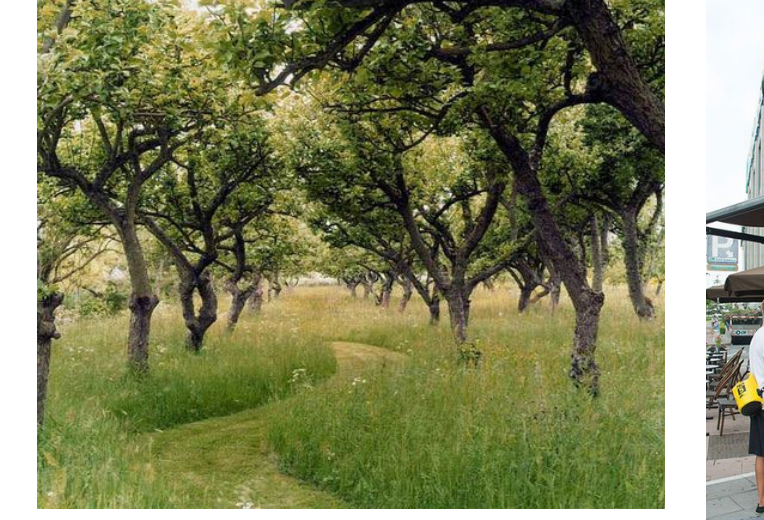
Community growing space

II.Areas of bulb (Snowdrop/Daffodil) planting