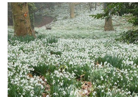
Seasonal bulb planting