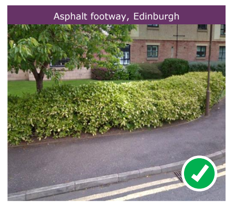
Google Maps, 2016